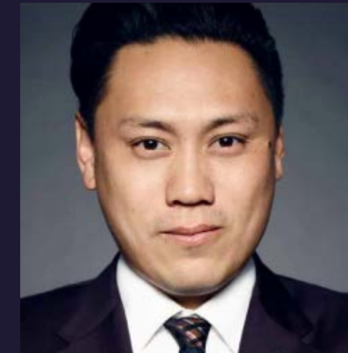
JON CHU | 2021 Filmmaker