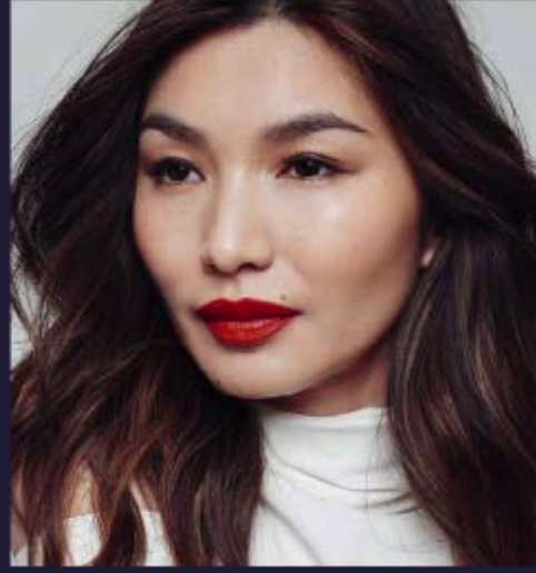
GEMMA CHAN | 2019 Actress, Producer, Activist