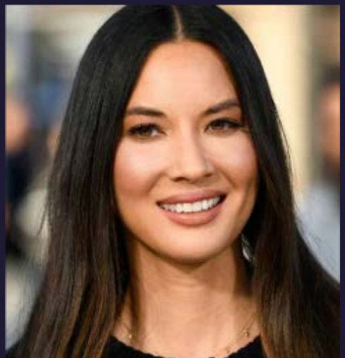
OLIVIA MUNN | 2019 Actress, Author