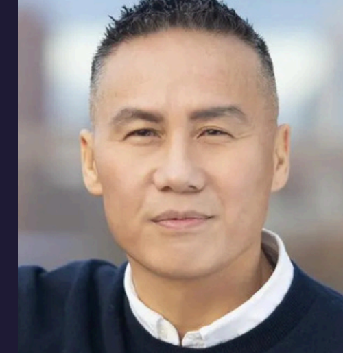
BD WONG | 2002 Actor, Director, Activist