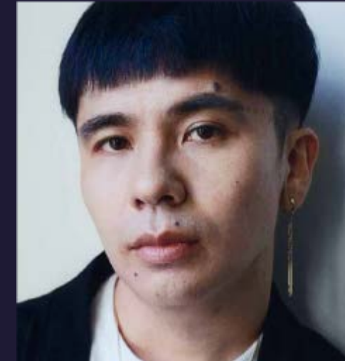
OCEAN VUONG | 2023 Author, Poet