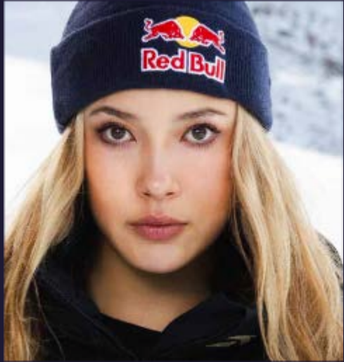
EILEEN GU | 2022 Olympian, Model