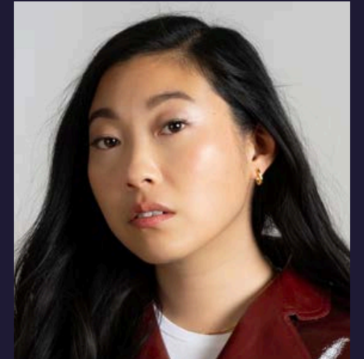
AWKWAFINA | 2021 Actress