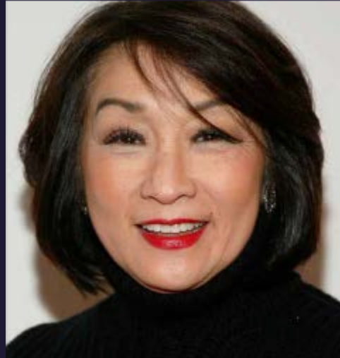
CONNIE CHUNG | 2017 Journalist, Author