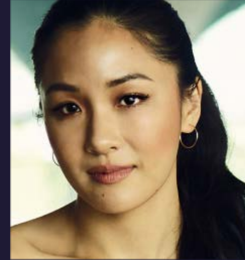
CONSTANCE WU | 2024 Actress, Author