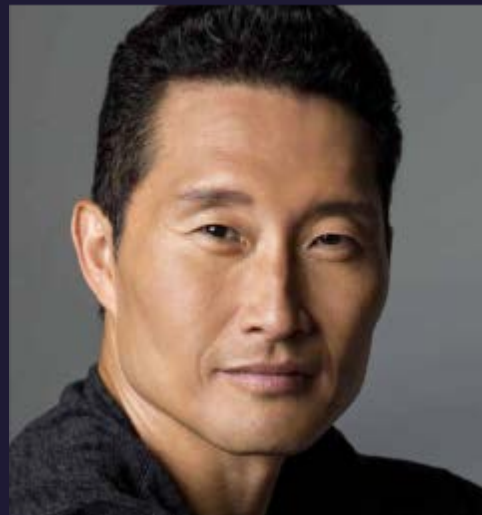
DANIEL DAE KIM | 2021 Actor, Producer